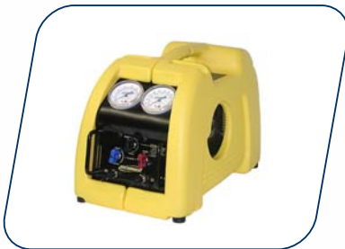
Stinger Refrigerant Recovery Unit