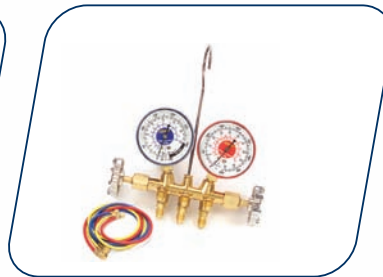
R-410A Manifold Set