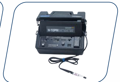
H10PM Refrigerant Leak Detector