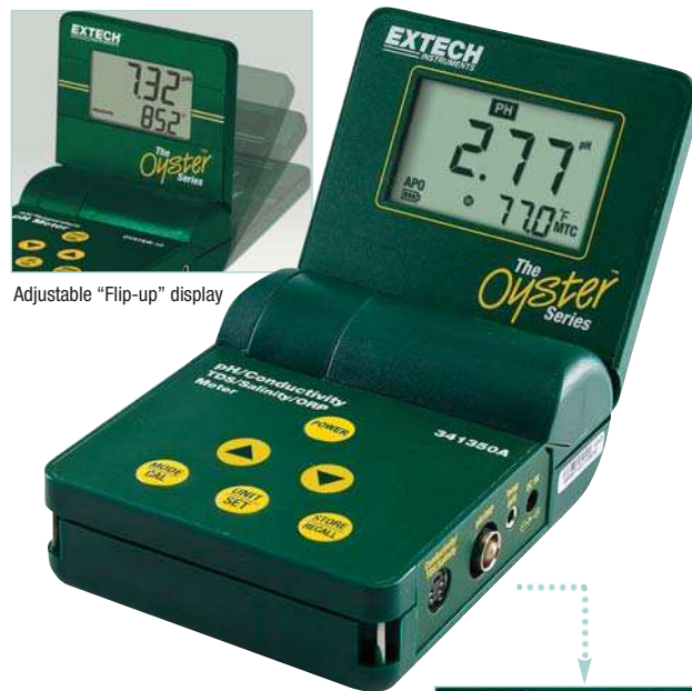
Adjustable “Flip-up” display