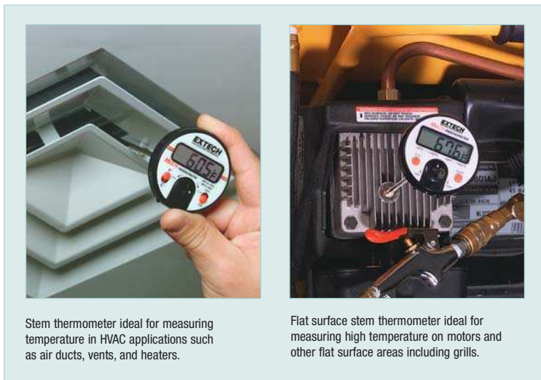
Stem thermometer ideal for measuring temperature in HVAC applications such as air ducts, vents, and heaters.