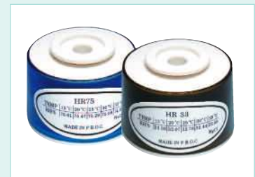
RH300-CAL Optional calibration salt bottles