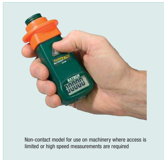
Non-contact model for use on machinery where access is limited or high speed measurements are required