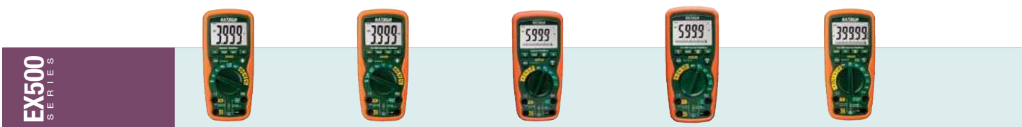
Drop-proof to 6 feet (2.9m)