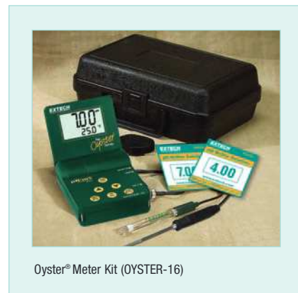
Oyster® Meter Kit (OYSTER-16)