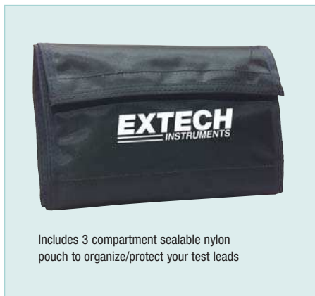
Includes 3 compartment sealable nylon pouch to organize/protect your test leads