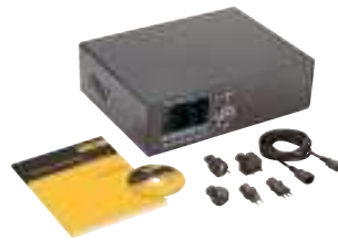
Fluke Norma 5000 Basic Configuration