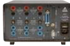
Fluke Norma 4000 (rear panel)

Each modular plug-in power phase consists of a voltage and a current measurement channel. Each measuring channel is available for each basic unit. However, only one kind of channel can be used per unit (see standard configurations).