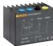
32 A Planar Shunt