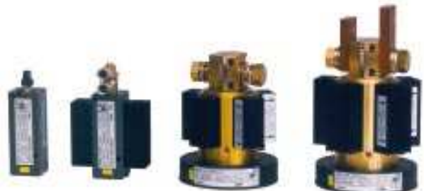
Optional shunts for Fluke Norma Series power analyzers