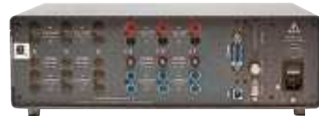
Fluke Norma 5000 (rear panel)