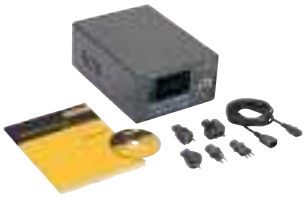
Fluke Norma 4000 Basic Configuration