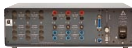
Fluke Norma 5000 (rear panel)