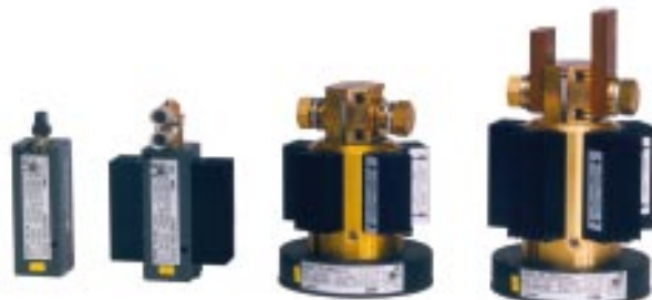
Optional shunts for Fluke Norma Series power analyzers