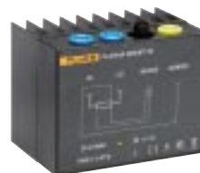
32 A Planar Shunt