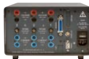
Fluke Norma 4000 (rear panel)

Each modular plug-in power phase consists of a voltage and a current measurement channel. Each measuring channel is available for each basic unit. However, only one kind of channel can be used per unit (see standard configurations).