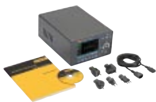
Fluke Norma 4000 Basic Configuration