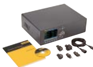
Fluke Norma 5000 Basic Configuration