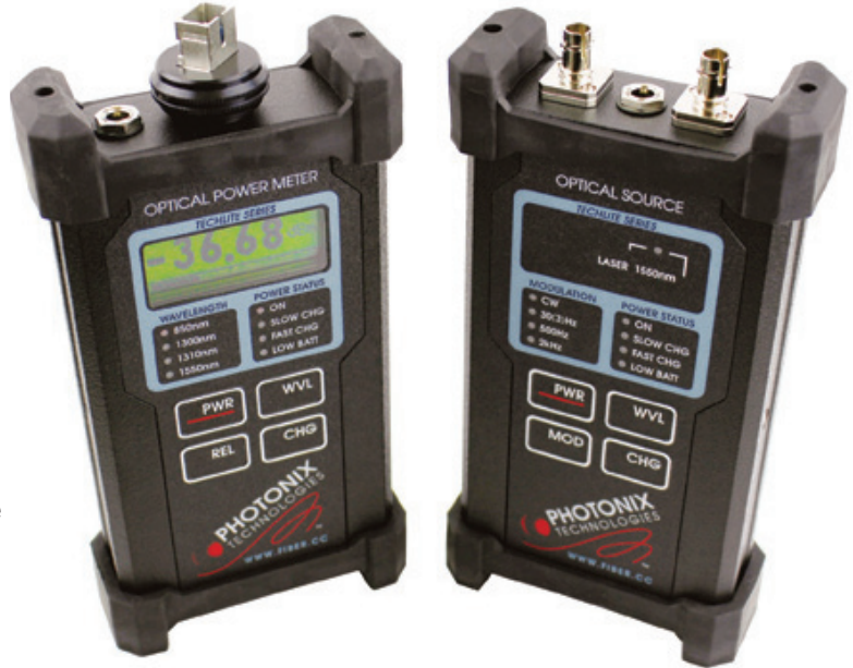
Note: Photos may vary from actual product

The TECHLITE™ series of test sets allow fiber technicians to perform precise optical testing in the field. The meters, when operated in absolute power mode, are used to determine the level of optical power being emitted from a transmitter. In relative mode, the meters are used with the included source to perform fiber loss measurements or splice tuning operations. The TECHLITE™ meter, in relative measurement mode, will store the zero reference reading for all four wavelengths independently in non-volatile memory. This allows all zero references to be taken at one time and also allows the unit to be turned off while moving between locations preserve battery life. The TECHLITE™ meters utilize a graphic LCD screen to create unusually large and easy to read numbers as graphics to indicate power levels.