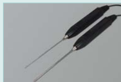
881603 and 881604 immersion probes