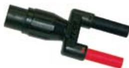
Banana (female) - BNC (male) Adaptor Catalog #2118.46 (optional)

**Available as special orders only. Contact customer service for current list price.