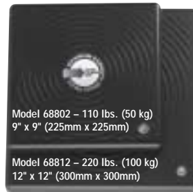
Model 68802 – 110 lbs. (50 kg) 9" x 9" (225mm x 225mm)