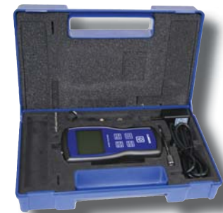
FG-7000 with Accessories in Protective Carrying Case