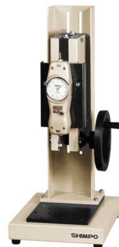
MF with FGS-100H Manually Operated Test Stand (sold separately)