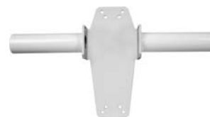
Optional MFP-Handle Ideal for Heavy Loads