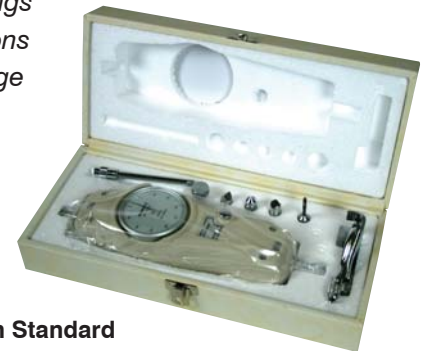
MF in Standard Carrying Case