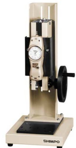
MF with FGS-100H Manually Operated Test Stand (sold separately)