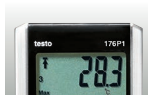
Large, clear display for showing measurement values