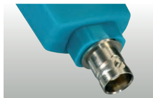
testo 206-pH3: pH3 probe head with BNC interface