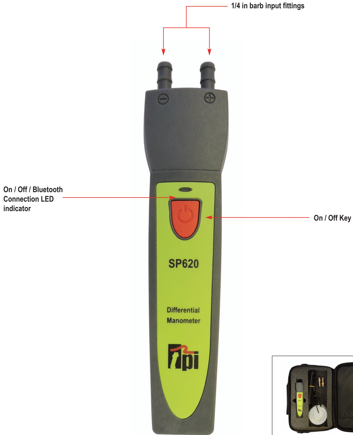
SP620 Photo Actual Size

L x W x D 6.7" x 1.5" x 0.75" 169mm x 39mm x 19mm