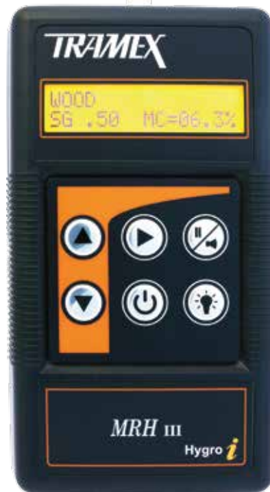
Product order code: MRH3