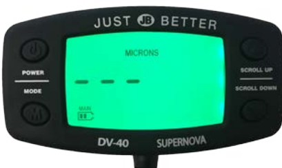
Loading Menu – Warm up mode

Note: The DV-40 is factory calibrated, field calibration is not required.