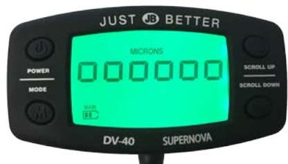
Atmospheric Pressure – Normal operation mode