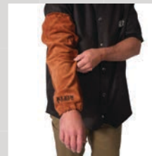
Flame-Resistant Leather Welding Sleeves O/S 60834