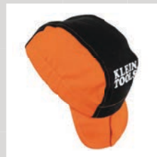
Flame-Resistant Welding Cap O/S 60898