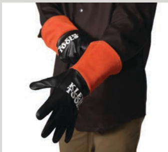
TIG Welding Gloves 60912 (L); 60913 (XL)