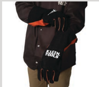
MIG Welding Gloves 60914 (L); 60915 (XL)