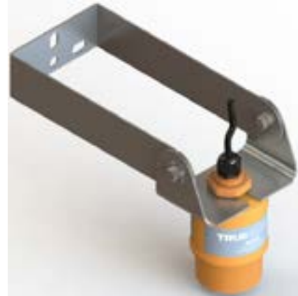
8" Mounting Bracket Accessory