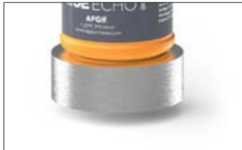
316L SS Threaded Weight