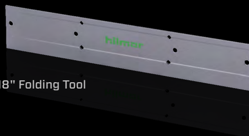
Advanced 18" Folding Tool 1890982