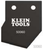
50060 Replacement Blade for 50043 PEX & Tubing Cutter