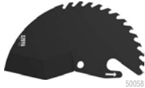
50058 Replacement Blade for 50054 PVC Cutter