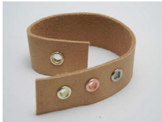
[Photo 7: "Finished" side of eyelets shows on "Smooth" side of work material.]