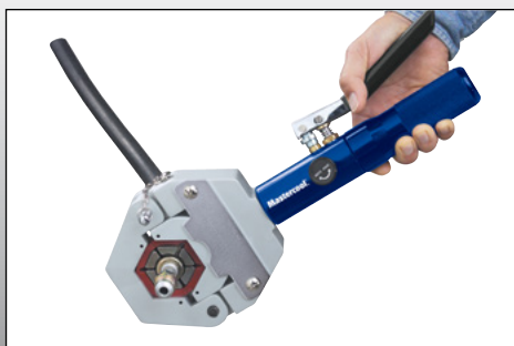
Easy to use hydraulic hand-held pump crimps the hose fitting in under 10 pumps.