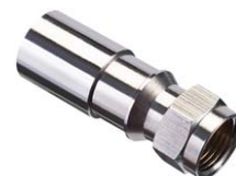
92-650 RTQ™ XR™