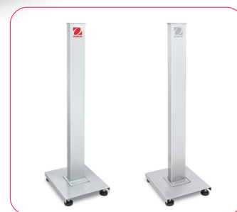
Painted & Stainless Steel Floor Stands (Optional)