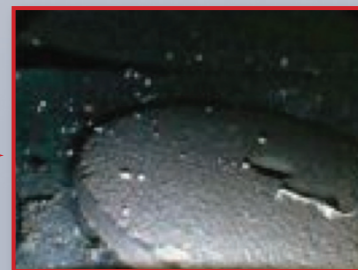
After pressing anti-reflection button (with mirror)