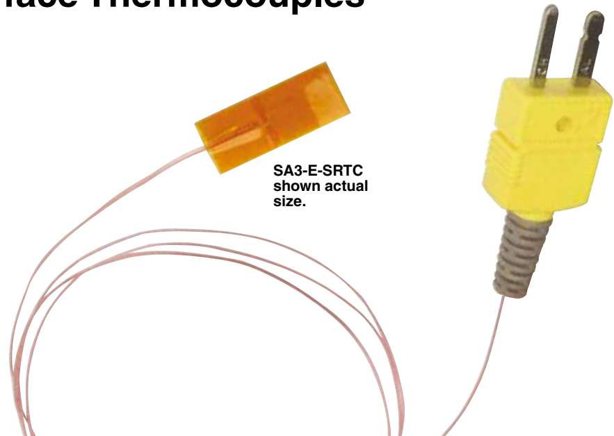
SA3-E-SRTC shown actual size.

These thermocouples can be used in outdoor and wet environments, including bright sunlight, with little to no effect on performance or accuracy. Our unique construction techniques provides a fast responding thermocouple junction in a thin and flexible mounting pad. These SA3 thermocouples are available in 2 styles, stripped #30AWG solid leads, or with a miniature color coded connector.