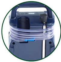
Mast and sampling tube are fitted to the pump, during use and transportation

The Vortex3 is an ideal device to be used by personnel carrying out sampling surveys trained to RP402 level by BOHS.